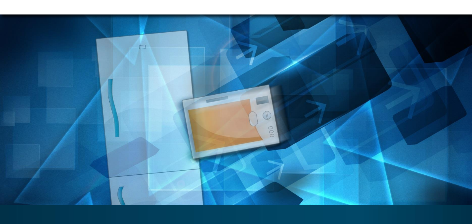
Table of Contents 2017

Smart Kitchens: Intelligent Planning, Shopping, and Cooking